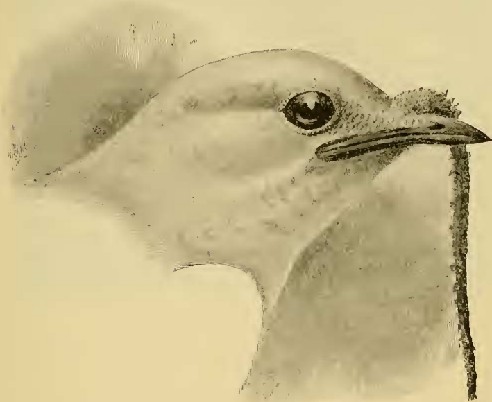
Head of Carunculated Bell-bird.

Sept. 3rd, 1896), in order to show the way in which the caruncle on the top of the bill is usually carried in life. It should be remarked that the caruncle is often considerably shortened, and at times only appears as a horn-like projection scarcely as long as the bill itself. The caruncle may hang down on either side.